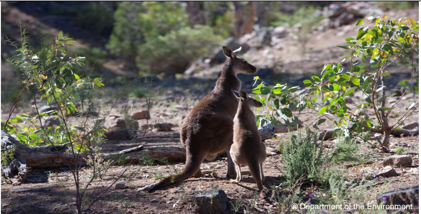
Kangaroos at the Mambray Creek Camping Reserve in Mount Remarkable National Park