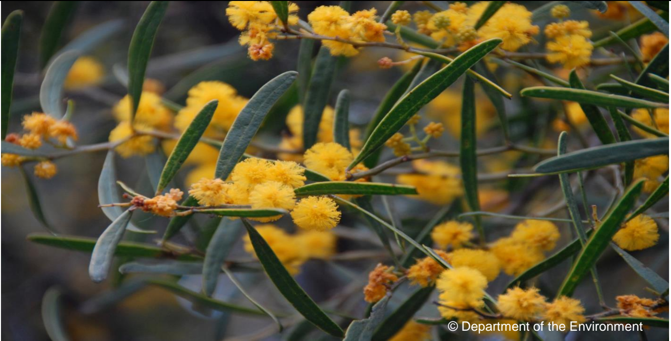
Wattle growing at Lake Clifton in the Peel Yalgorup System Ramsar site