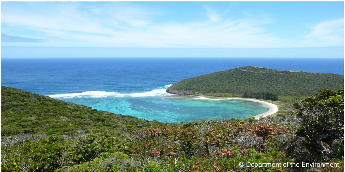
North Beach from Kims Lookout, Lord Howe Island Group (World Heritage Listed Site)