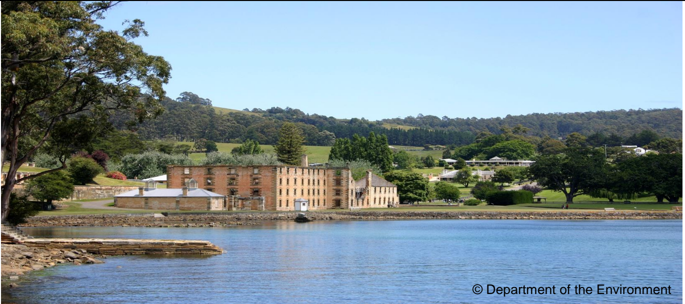
The Main Penitentiary Building at the Port Arthur Historic Site (Part of the World Heritage Listed Australian Convict Sites)