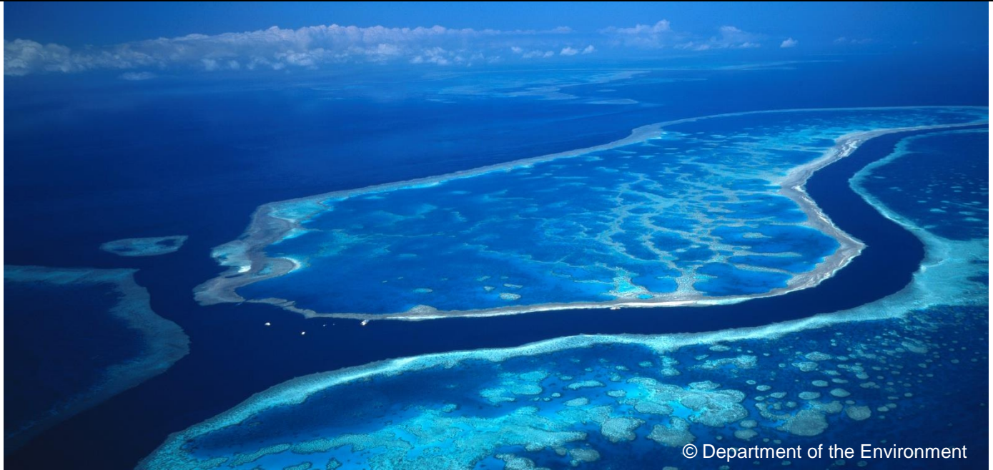
Aerial view of Hardy Reef in the Great Barrier Reef